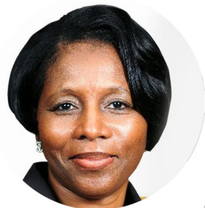
Minister Ayandla Dlodlo

Other strategic areas in which the MPSA will work with the PSC include amongst others, the development of a framework on Life Style Audits, Mitigation of Impact of rising Public Service Wage Bill, and revival of the Ethics, Integrity and Disciplinary Technical Assistance Unit (TAU).