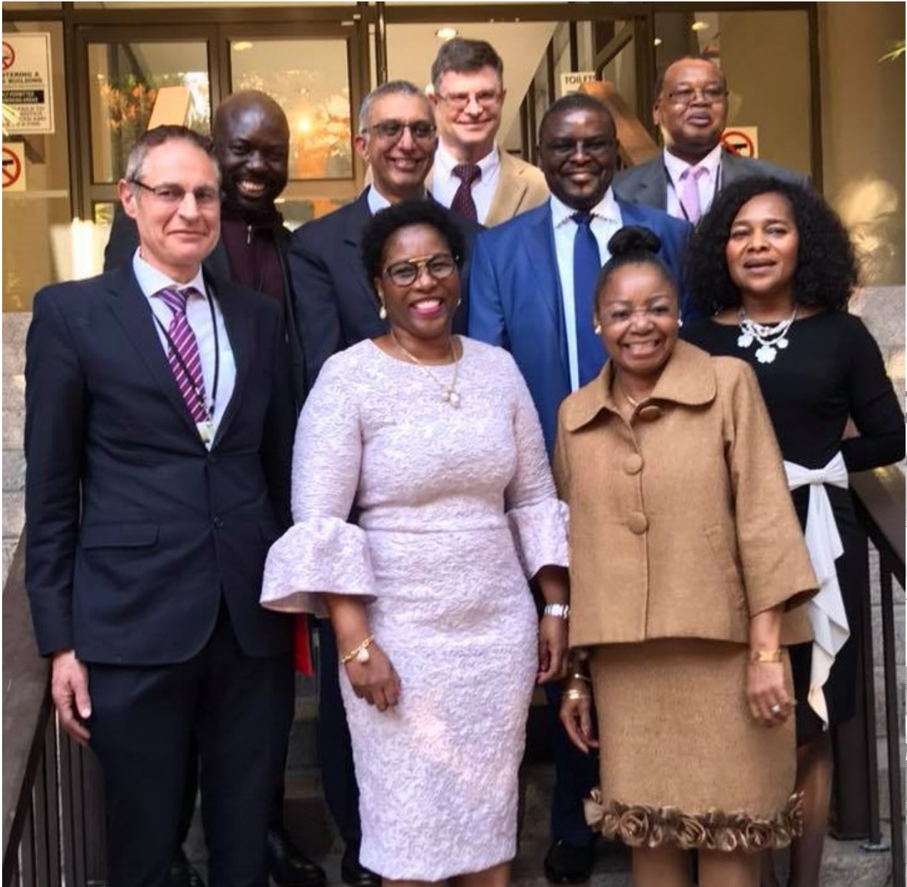
Minister Ayanda Dlodlo, Deputy Minister Chana Pilane-Majake and the leadership from MPSA Entities during the Budget Vote Speech 2018 in Parliament