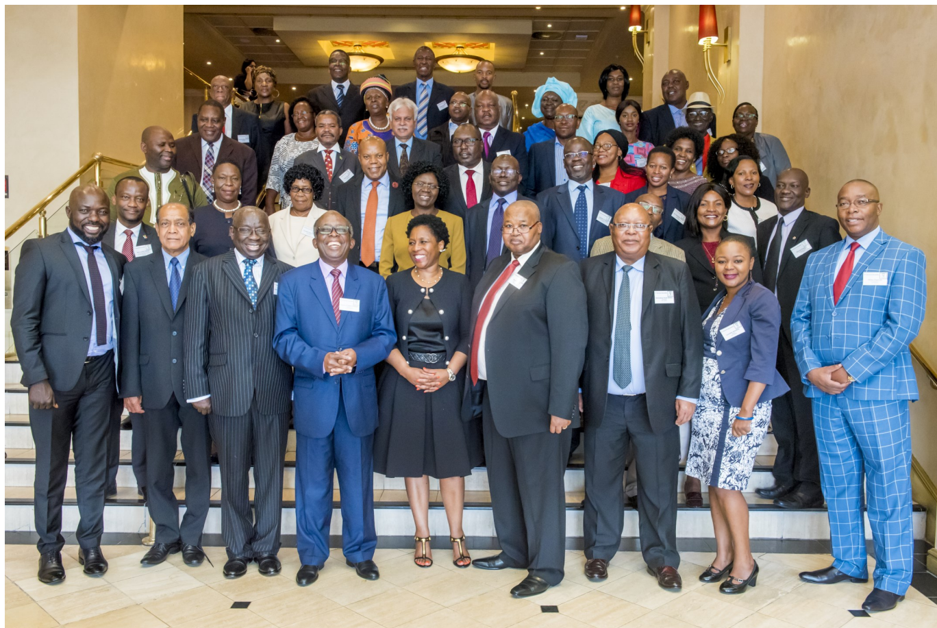
Minister Ayanda Dlodlo with AAPSComs Delegates